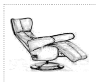
swivel chair relax electric massaging HIGH