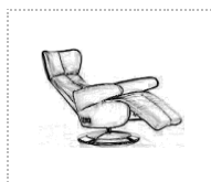
swivel chair relax electric SMALL