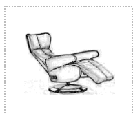
swivel chair relax electric massaging SMALL