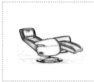
swivel chair relax electric massaging SMALL