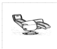
swivel chair relax electric SMALL