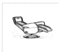
swivel chair relax mechanical SMALL