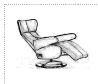
swivel chair relax electric massaging MEDIUM