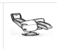
swivel chair relax electric MEDIUM