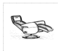
swivel chair relax mechanical MEDIUM