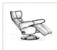
swivel chair relax electric MEDIUM