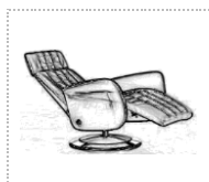
swivel chair relax mechanical HIGH